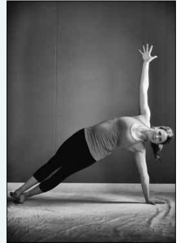
Side plank pose